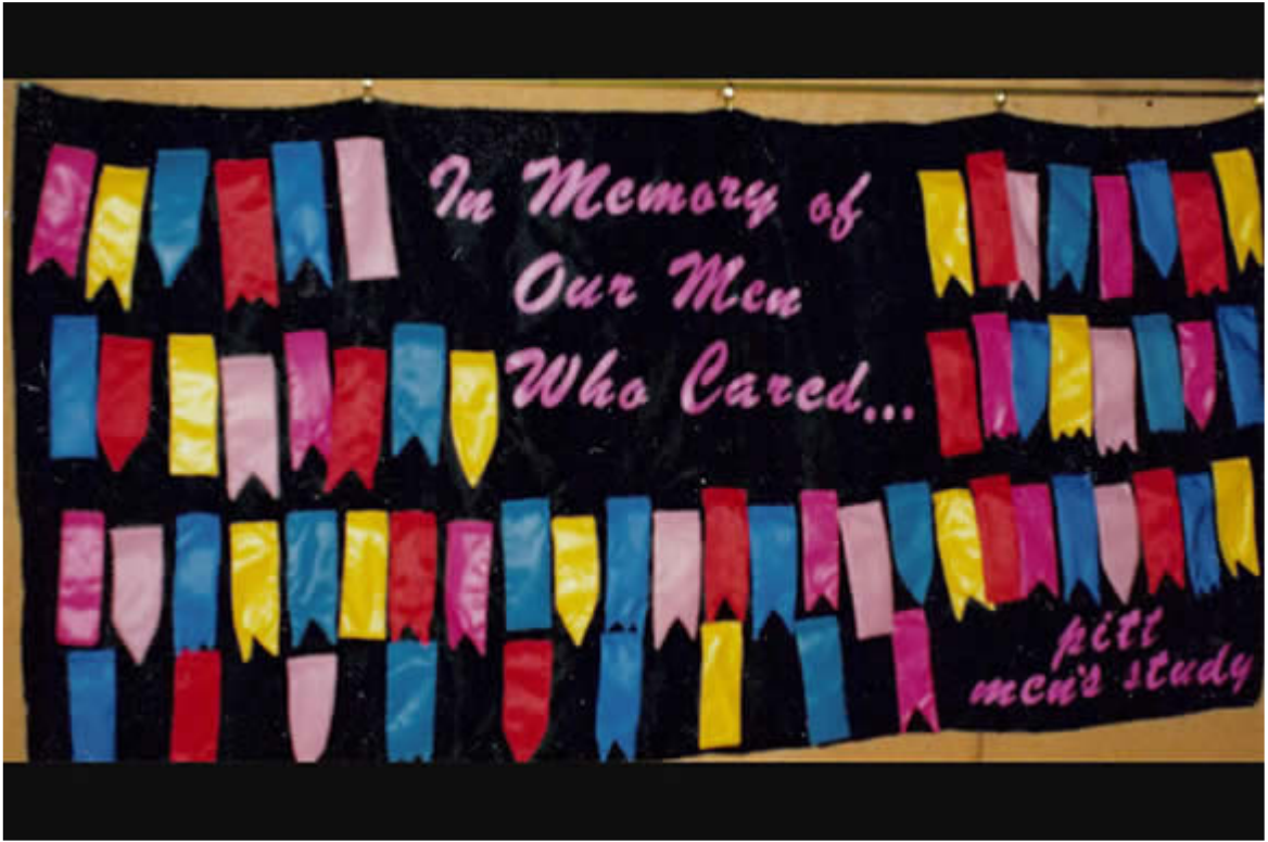
PMS clinic staff...